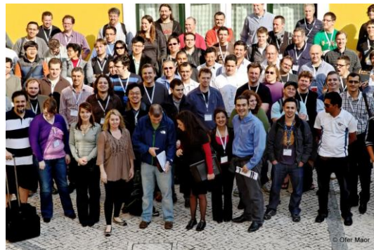
OWASP Summit 2011 Portugal