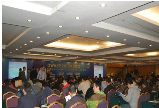
OWASP AppSec China 2010