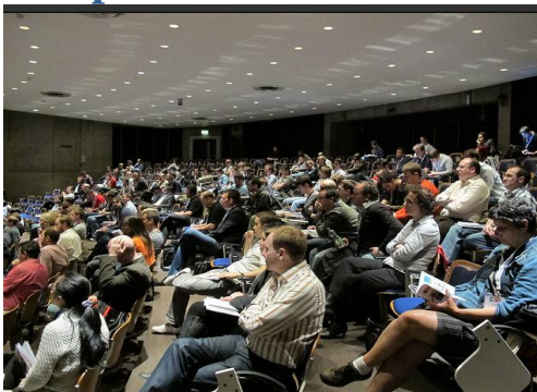
AppSec EU 2011