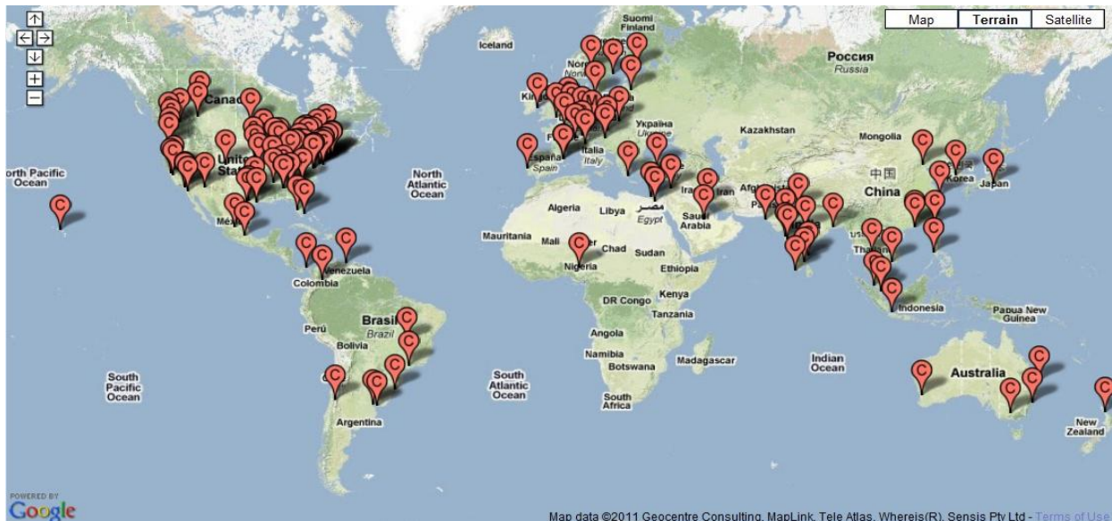
OWASP Chapters around the World