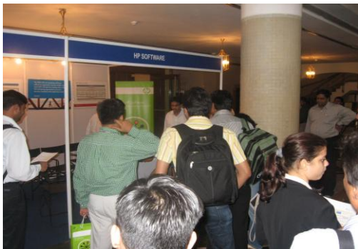
OWASP AppSec Delhi 2008