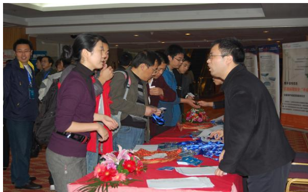
Audience and vendors connected in product expo

Sponsors will gain exclusive access to companies in Asia through a limited number of Expo floor slots, providing a focused setting for potential customers.