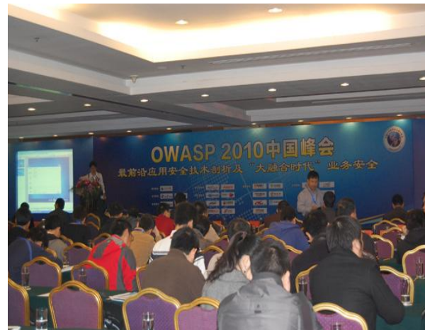
OWASP China 2010 attracted over 500 attendees

OWASP events attract a worldwide audience interested in finding out what's next in web application security. As an OWASP conference sponsor, your brand will be included as an answer.